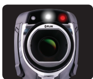
Visible Light Pictures Align with Thermal Images: 3.1MP Digital Camera, LED Lamp, and Laser Pointer