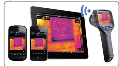
FLIR Tools Mobile Wi-Fi Connectivity