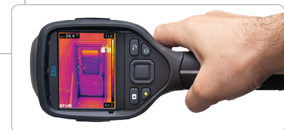
Auto-Orientation Keeps Diagnostics Overlays Upright