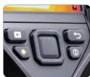
Large Buttons for Easy Glove-Handed Operation