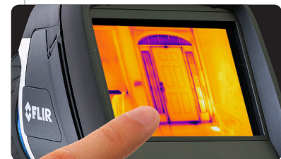
Large 3.5" Touchscreen