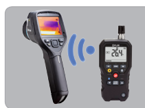
Bluetooth® METERLiNK® Communication