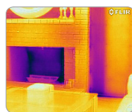
MSX Image Enhancement